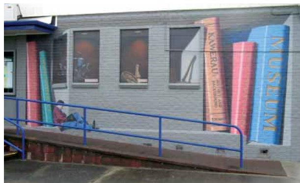
The Sir James Fletcher Kawerau Museum has a strong relationship with stakeholders.