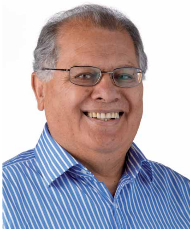
Wira Gardiner, Chair Museum of New Zealand Te Papa Tongarewa, Wellington