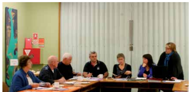
The Board of the Whanganui Regional Museum.

To assist the process, the committee could establish a small sub-committee consisting of some committee members, and possibly non-committee members as well, to be the ‘future direction’ planning team. This group would do some of the initial thinking about the future direction of the organisation. Ultimately, however, taking responsibility for the future well-being of the organisation is not something a ‘committee’ can avoid any more than a ‘board’.