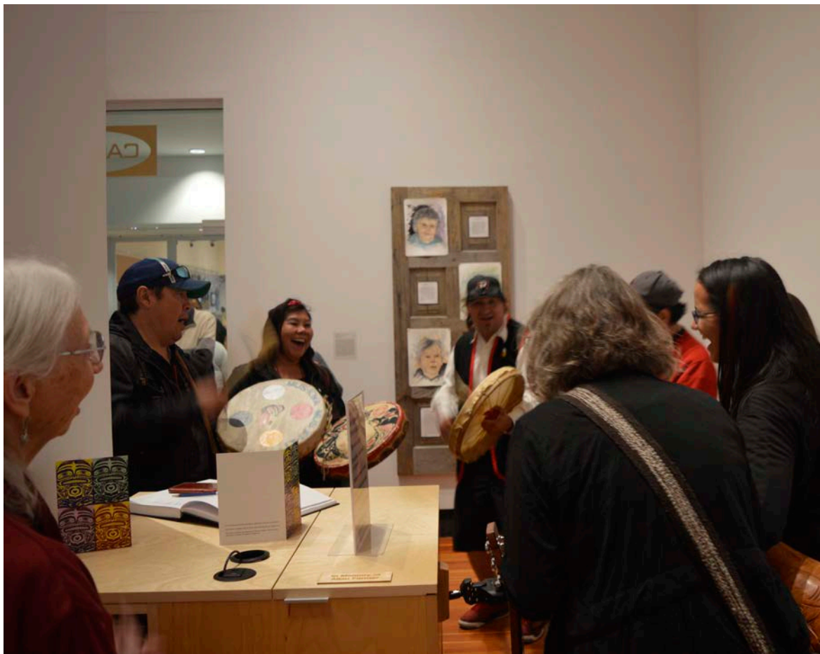
Redress opening visitors drumming and singing, 2019.