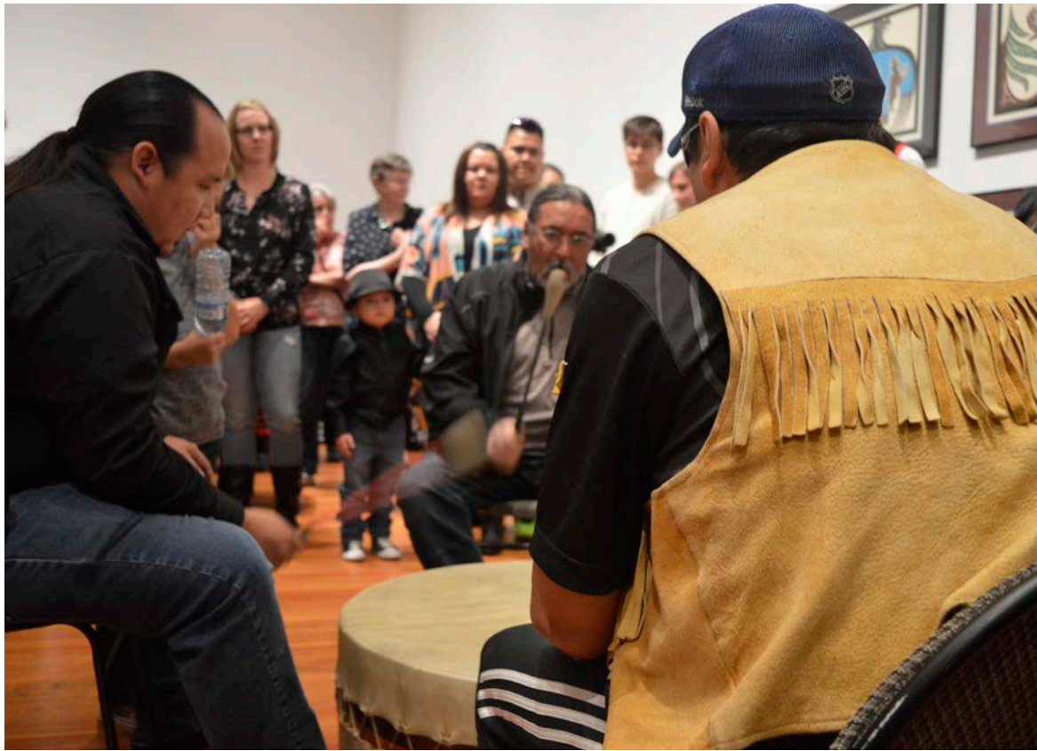
Lheidli T'enneh drums group performing at Redress opening, 2019.