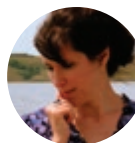
Table 5: The Future of Museum Standards in Canada

Corporate Communications Manager, Royal BC Museum