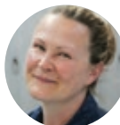
Table 2: Building Flexible Resources for Educators