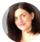
Table 6: Collections Evaluation and De-accessioning

Heritage Information Analyst, Standards, Canadian Heritage Information Network