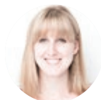
Table 4: Social and Traditional Media

Co-op Coordinator, Humanities and Fine Arts, University of Victoria