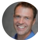
Table 7: Smart fundraising