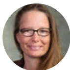
Table 3: Working with Students

Education & Outreach Manager, Beaty Biodiversity Museum