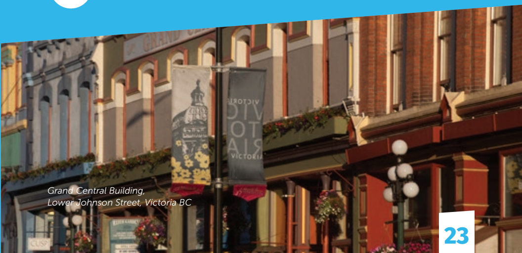
Grand Central Building, Lower Johnson Street, Victoria BC

630 Yates Street, Oct 4, 6-7: 10am-4pm; Oct 5: 10am-8pm