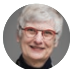
Senator Patricia Bovey

Senator Bovey's presentation is generously sponsored by the Department of Art History & Visual Studies and the Faculty of Fine Arts at the University of Victoria, as part of the Fine Arts Orion Lecture Series