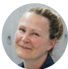
Table 3: Building an Outreach Kit

Archivist, Chilliwack Museum and Archives