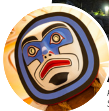
Contemporary Art work at Squamish Lil'wat Cultural Centre