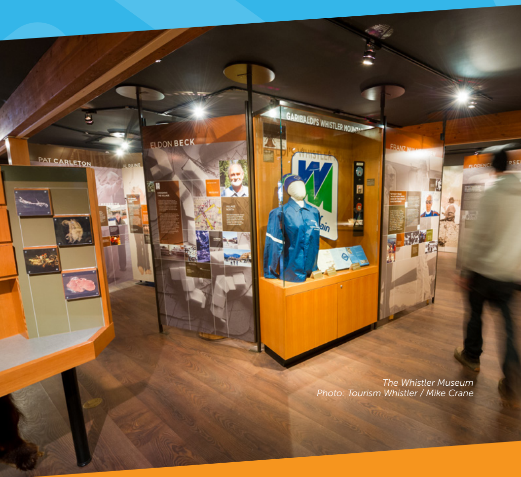
The Whistler Museum