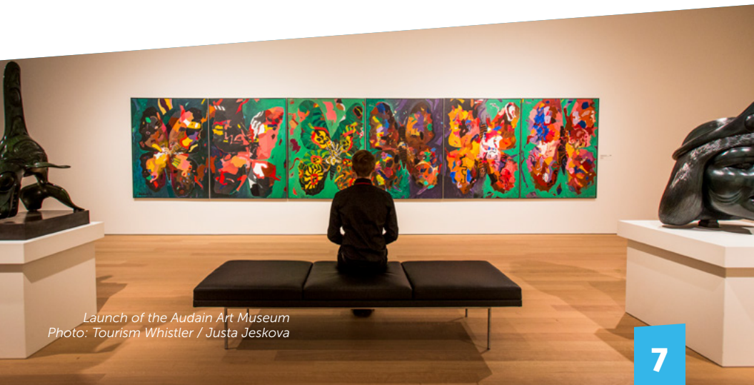
Launch of the Audain Art Museum