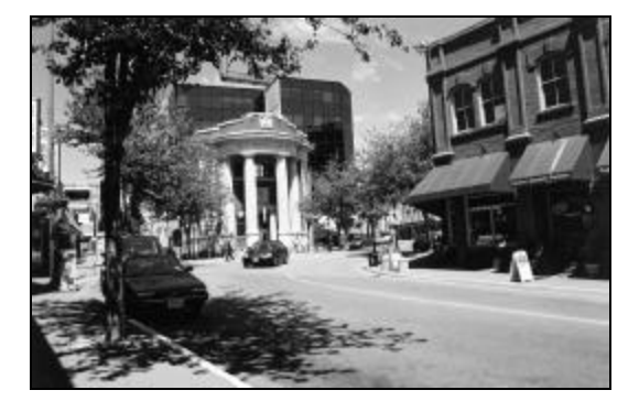
The Arts District in Downtown Nanaimo is filled with colour, texture and talent.

Start your Crawl with a reception at the Nanaimo Art Gallery and enjoy refreshments and live entertainment. Your Crawl Passport will lead you to shopping, galleries, historic pubs and end with great prizes at the Art Gallery!