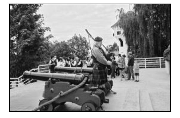
Visitors to the Harbour City enjoy our Traditional Noon Cannon Firing Ceremony during the summer at the Bastion.

A No-Host bar will be open until 11 pm while you enjoy entertainment and fellowship with friends.