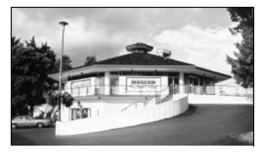
Nanaimo District Museum, built in 1967, sits atop a picturesque knoll overlooking the harbour in the heart of Downtown Nanaimo.

An opportunity to see Nanaimo District Museum's Phase I of the New Upper Gallery and enjoy refreshments, visiting with friends, entertainment and prizes.