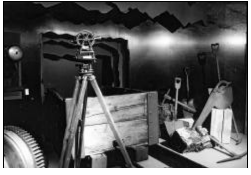
The Coal Mining in Nanaimo exhibit, completed in 2001, received rave reviews from the BCMA.