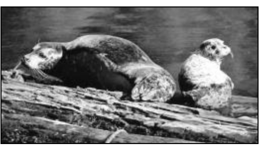
Harbour seals are plentiful in our waters and they're often the highlight of a trip to beautiful Vancouver Island.

These post-conference tours will only go if there is sufficient interest and numbers. Please indicate your interest on the registration form. Fees will be collected at the Conference Registration Desk.